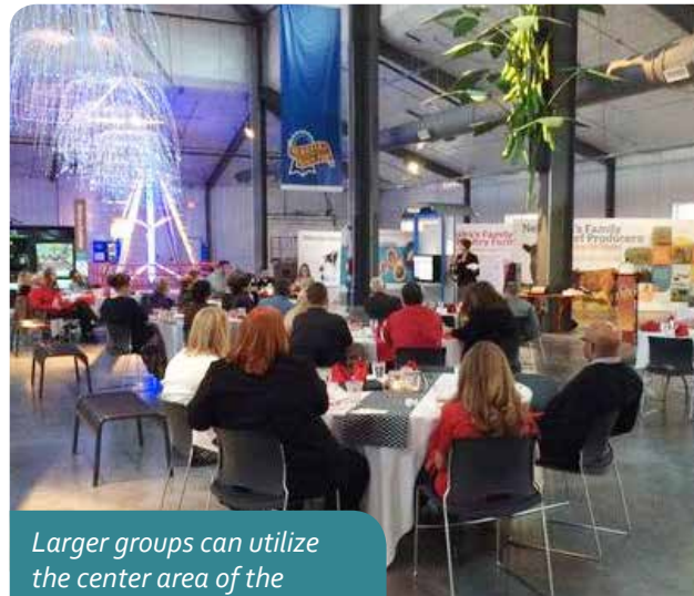
Larger groups can utilize the center area of the exhibit space, offering room for up to 350 guests.

We welcome you to Raising Nebraska and invite you to discover the experience!