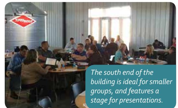
The south end of the building is ideal for smaller groups, and features a stage for presentations.